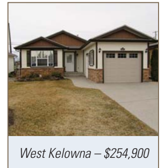
West Kelowna – $254,900

under the $260,000 price point. However, very few options exist under the same threshold in the single-family category, with just 39 homes currently listed for sale—most of which can be described as handyman specials. Those opting for condominiums will find 151 one-bedroom units currently listed for sale, with an average asking price of $255,000, typically averaging 800 sq. ft. Apartment-style units can start as low as $200,000 in older areas of the city that are being revitalized. While affordability is an issue for some, a growing number of first-time purchasers are spending amounts closer to average price, typically between $350,000 and $400,000. Residential average price currently hovers at $390,000. Popular are starter homes located in established communities, including Glen Rosa, Rutland, and North Glenmore on the peripherals, as well as Central Kelowna. Starter product can run the gamut from newer construction to older, renovated homes. Buyers that can afford it are choosing to ante up to secure the best location possible for the dollar, while those on a strict budget will look to the peripherals—a reasonable trade-off, placing suburban homeowners just twenty minutes from Kelowna proper. The greatest opportunity that exists at present for entry-level buyers are prices that remain off year-ago levels. Housing values have been relatively flat over the past six months, but the gap is now closing