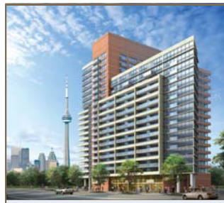
King West, Queen West $319,900

C01, bordered by Lake Ontario to the south, Yonge St. to the east, Dufferin St. to the west, and Bloor St. to the north, home to Toronto's condominium boom, is the hub of new and resale activity in the GTA. Just 77 resale apartment and town house units are currently listed for sale under $275,000 in the