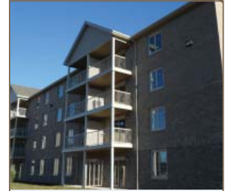
Downtown – $115,900

With a good selection of product—and something for every budget—homeownership in Moncton remains attainable for most first-time buyers. In many cases, owning compares to renting, so it's no surprise that entry-level purchasers continue to drive momentum in Moncton's residential housing market.