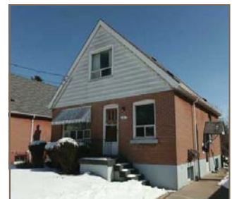
Central Mountain Area $115,900