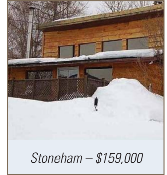
Stoneham – $159,000

bished 800 sq. ft., one-bedroom unit in the city centre. The most popular neighbourhoods among first-time purchasers include the suburban areas of Levis, Charlesbourg and Limoilou, where homeownership can usually be realized for at or under average price. The vast majority of today's buyers are willing to sacrifice location to get the greatest bang for their purchasing buck. However, some select entry-level buyers are anteing up substantially more—foregoing typical starter product in favour of newer homes, priced between $250,000 and $300,000, in established communities such as Cap-Rouge, Ste-Foy, and St-Augustin-de-Desmaures. Dual-income couples comprise the vast majority of Québec City homebuyers, with very few singles in the marketplace. New financing criteria has had little impact on the local market, although there has been an upswing in activity reported in recent weeks—credited to improving weather conditions and strengthening consumer confidence. With an ample selection of product available for sale at all price ranges and increasing demand, a solid spring market is forecast.