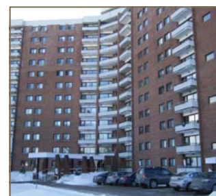
Parkwood Hills – $174,900

move to multi-unit residential allows them to live in one-half of their investment, and rent out the other half, covering a significant portion of their mortgage payment. While not everyone wants to be a landlord, this product tends to move quickly when listed, often selling in multiple offers. Despite rising