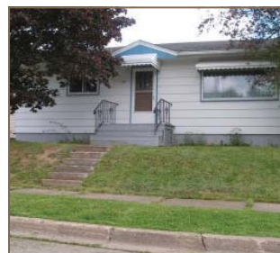
North End – $114,900

Year-to-date real estate activity is well ahead of the 10-year average (256 units)—by nearly 30 per cent, in fact—with sales reaching 332 units at the end of February. Boasting one of the highest affordability levels in the country, with an average price now hovering near $155,000, purchasers in Moncton are well-positioned, particularly given today's rock-bottom interest rates. Most making their first foray into real estate are now spending between $120,000 and $150,000, and some are anteing up to $250,000 to secure location. While properties can be had for well under $100,000, the vast majority under that price point tend to be seasonal properties or mini-homes. Sales under $120,000 account for just