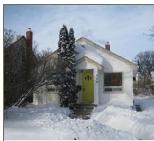
Winnipeg – $152,000

to $40,000, but the typical entry-level price is closer to $85,000 for a small apartment just outside the core in areas such as west end Winnipeg or Elmwood. Yet, even in the condo segment, purchasers are spending more, with most paying between $120,000 and $130,000 plus